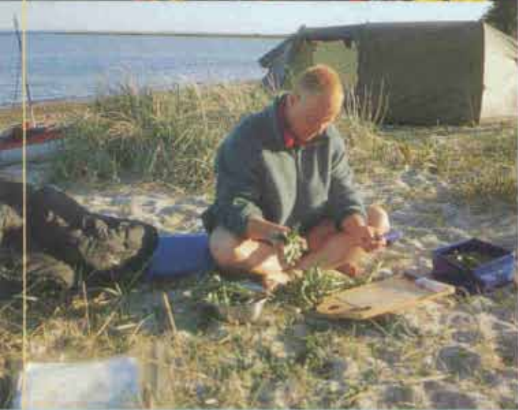
Top to bottom: Divine paddling: low swell, stern winds in the Danish South Sea, pushed forward by my bright red spinnaker. Working hard on cleaning the salad at a beach near Ærøskøping. Right: A good spot for a break.