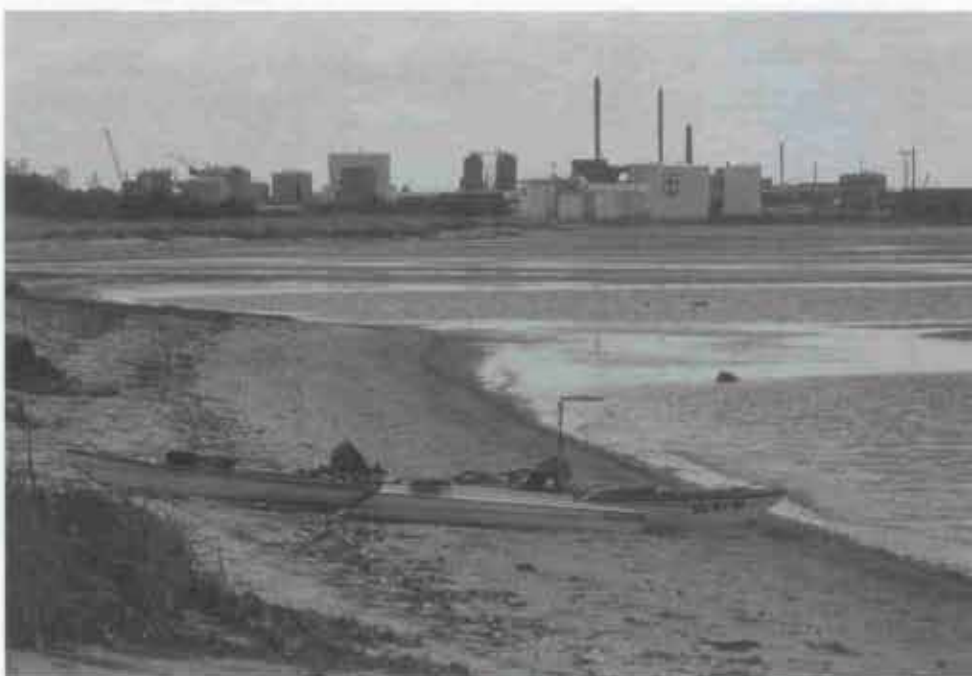
Coming ashore near industrial buildings by Copenhagen

After washing up, I tried to drag the loaded boat up the beach, but I had left most of my strength somewhere in the channel. Unable to budge the kayak, I unloaded the tent from its dry bag and set up camp. After I had emptied and cleaned the kayak, I set it on the beach, ready for the next day.